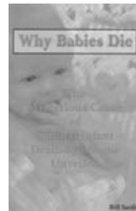
Why Babies Die $7.00