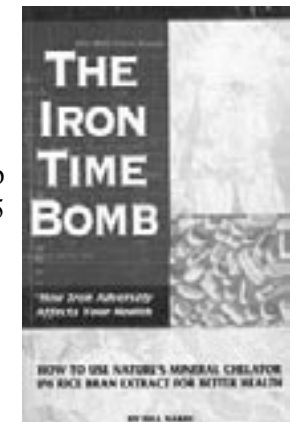
The Iron Time Bomb $24.95